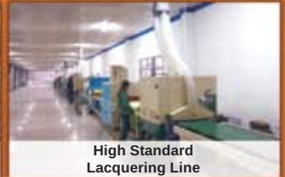
High Standard Lacquering Line